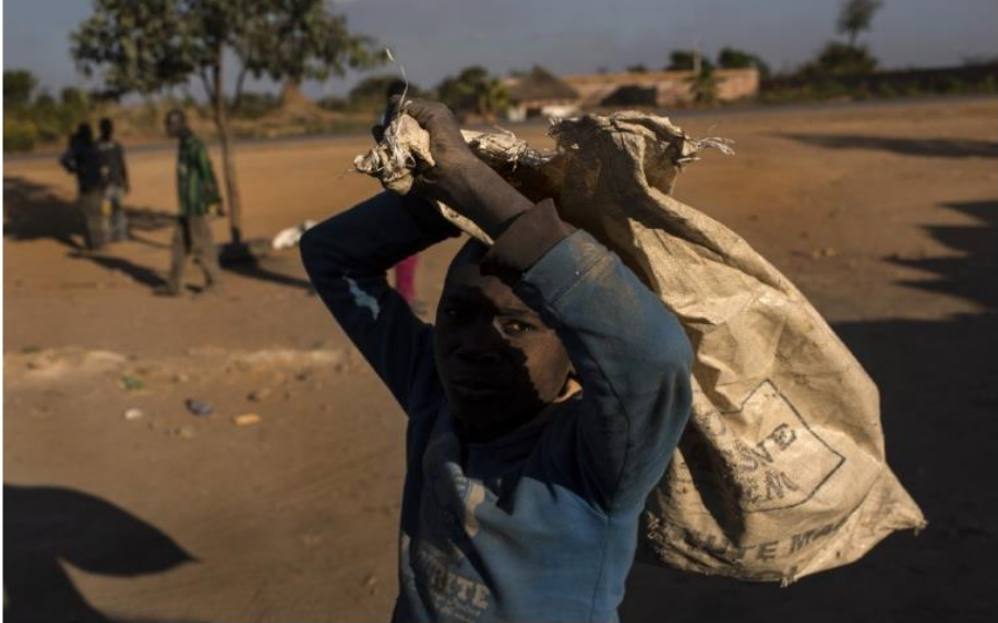
A boy carries a bag used to transport cobalt-laden dirt and rock at a mineral market near Kolwezi, Congo.

The effort to learn what Congo's miners think about their jobs began with a simple text message.