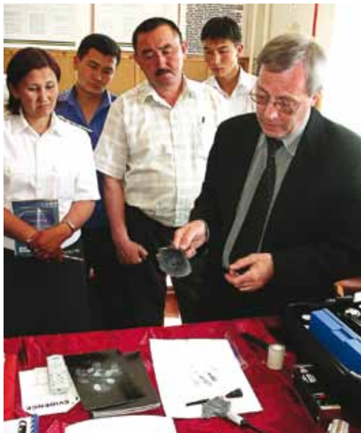
Police training in Bishkek. The Office of Internal Oversight evaluated OSCE police training activities in Kyrgyzstan and also in Serbia and the former Yugoslav Republic of Macedonia from 2009 to 2010.