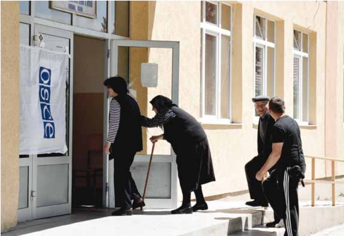
Voters in the village of Laplje Selo, an ethnic Serb enclave in Gračanica/Gračanicë municipality near Prishtinë/Priština, enter an OSCE-organized polling station to cast their ballots in the first round of the Serbian presidential and parliamentary elections, 6 May 2012.