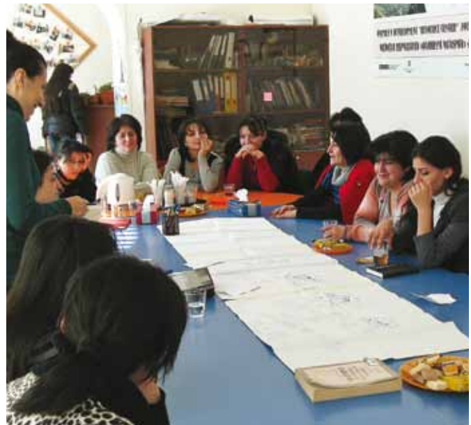
An Office of Internal Oversight evaluation team documents how the OSCE has made a difference in the lives of members of a women's resource centre in Armenia supported by the OSCE Office in Yerevan, November 2011.