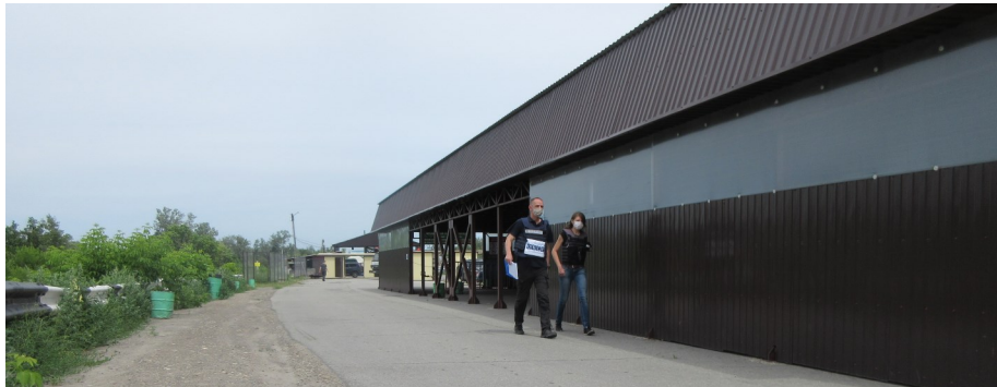
The SMM near Stanytsia Luhanska bridge