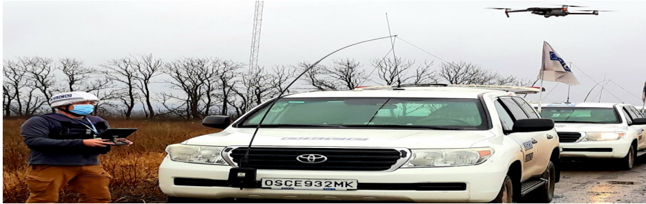
SMM patrol monitoring Disengagement Area 3