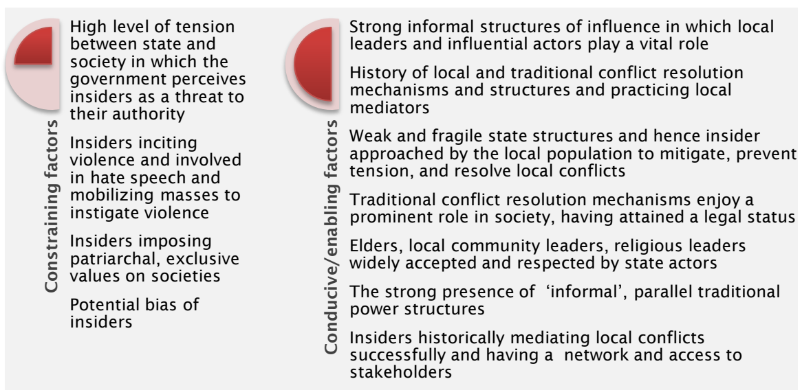
Figure 2: Factors for engagement with insider mediators

opportunities, and offer organizational, procedural, logistical, and advisory support — all as per stated needs. The best kind of support is dialogic mutual support, i.e. support based on conversation and interaction between the insider and outsider, which nurtures joint-learning, methodological exchange, knowledge-building, and problem-solving. In some cases, outsiders can simply act as a sounding board or advisors.