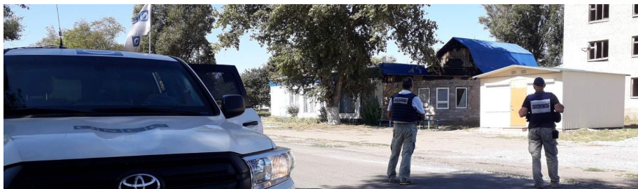
SMM monitoring officers in Lebedynske, Donetsk region