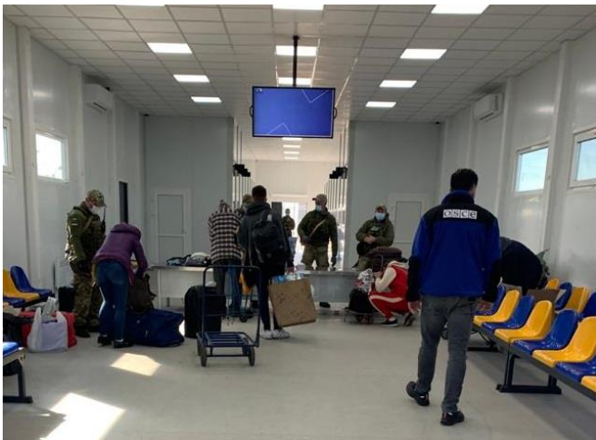
Civilians at the EECF near government-controlled Stanytsia Luhanska, Luhansk region, October 2021

Out of the 378 civilians the Mission spoke with, 258 people (174 women and 84 men, mixed ages) were interviewed at the crossing points and explained their reasons for crossing in either direction. The main reason was linked to family reunification, visiting relatives and returning to their places of residence – this accounted for just over 50 per cent of the