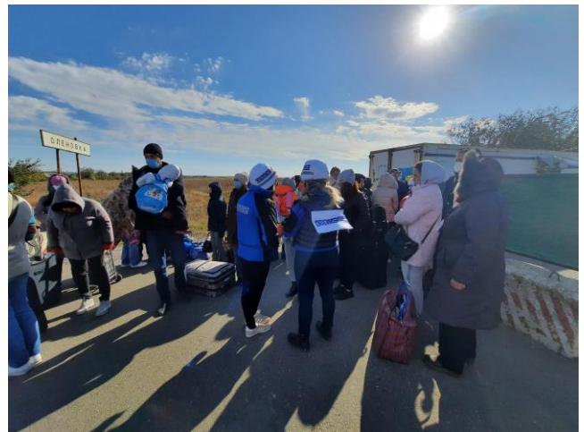
OSCE SMM staff speaking with civilians at the corresponding checkpoint of the armed formations near non-government-controlled Olenivka, Donetsk region, October 2021

In addition, civilians also explained that it was sometimes difficult to reach the armed formations to obtain “permission” to cross. Some said that the telephone numbers provided did not work when calling from government-controlled areas, and, as a result, they could not proceed with their plans to cross the contact line.