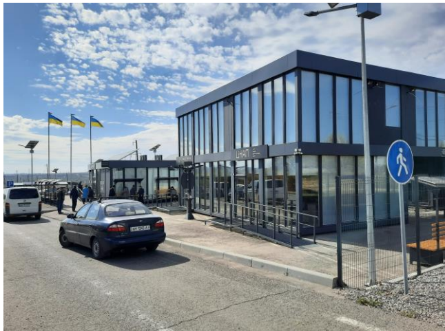
Modular administrative centre at the EECP near government-controlled Novotroitske, Donetsk region, October 2021

During the reporting period, the Mission noted the establishment of two modular administrative centres at the EECPs near Shchastia and Novotroitske, which were opened on 10 November and 16 December 2020 respectively. These centres provide a common space for civilians to access administrative, medical and other services, and have sanitary facilities. The Ministry of Reintegration of the Temporarily Occupied Territories announced in December 2020 that all EECPs along the contact line will become equipped with similar modular administrative centres. 47 Outside of the reporting period, in October 2021, the SMM observed the beginning of construction work for a modular administrative centre at the EECP near Stanytsia Luhanska.