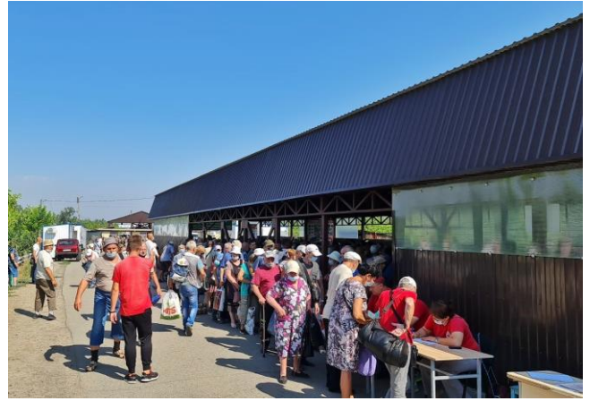
Civilians crossing through the corresponding checkpoint of the armed formations south of the Stanytsia Luhanska bridge, Luhansk region, August 2021.

However, several international organizations and NGOs have reported that according to the Cabinet of Ministers’ Resolution No. 1596, 26 pension payments were still suspended for bank accounts that have been dormant for