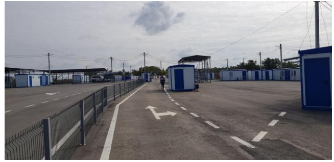
Corresponding checkpoint of the armed formations near non-government-controlled Vesela Hora, Luhansk region, October 2021

Secondly, civilians are also affected by the complicated requirements that they have to fulfil before they are allowed to cross the contact line to visit family or access needed services. Civilians underlined the difficulties they faced due to the measures imposed on them by the armed formations. The difficulties pertained primarily to how often civilians can cross the contact line, the obligation to seek “permission” before their journey, and documents needed to prove residency. The SMM