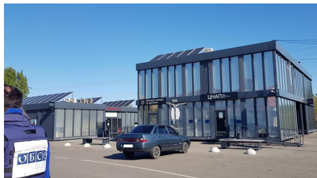
Modular administrative centre at the EECP near government-controlled Shchastia, Luhansk region, October 2021

At the EECP near Shchastia, the SMM observed 14 processing booths, one tent operated by the SESU, a bomb shelter, as well as the aforementioned modular administrative centre. Moreover, the Mission observed toilets, including one for persons with disabilities, a medical facility together with a stationary ambulance, as well as a COVID-19 testing facility.