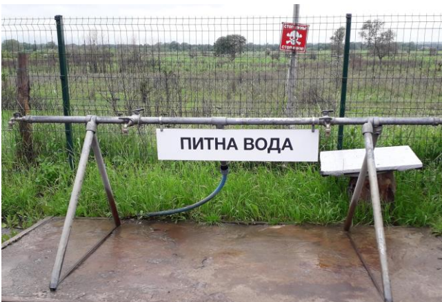
A red mine sign located just behind a pipe providing drinking water near the EECP near government-controlled Stanytsia Luhanska, Luhansk region, June 2021.

The SMM continued to observe the presence of mines, unexploded ordnance (UXO), and other explosive objects within 300 metres of the crossing points. This is despite the explicit mentioning of crossing points in the commitments contained in Article 6 of the 2014 Memorandum 40 to prohibit the installation or laying of mines in a 30km-wide security zone around the contact line and in the Trilateral Contact Group's Decision on Mine Action of 3 March 2016. 41 During the reporting period, the Mission observed hundreds of mines and mine