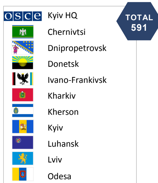
SMM teams are deployed to ten locations in Ukraine. The head office is in Kyiv.