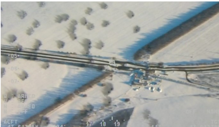
An image taken by the SMM's Unarmed/Unmanned aerial vehicle (UAV) on 14 January 2015, showing shell impact craters at Volnovakha, where a bus was hit on 13 January.