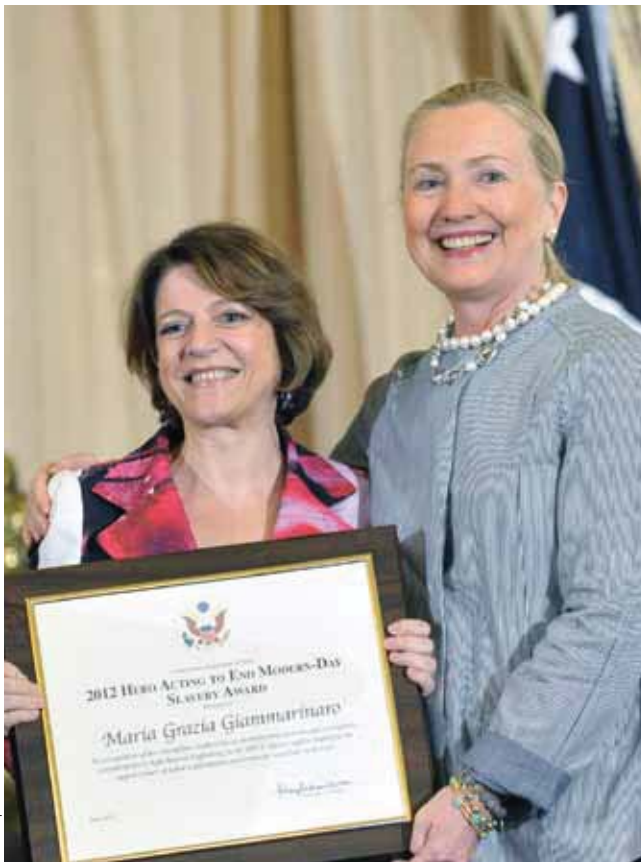
U.S. Department of State

The Special Representative has promoted the OSCE’s human-rights approach to human trafficking, advocating for a victim-centred focus, and strengthening co-operation between governments and civil society, which has proved vital to both effective protection of victims and successful prosecutions.