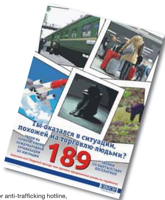
Poster for anti-trafficking hotline, OSCE Centre in Bishkek

from four Central Asian Republics in May 2012. Follow-up actions will be promoted at the regional level. The results of the project will be used to facilitate dialogue and to inform state policies on combating trafficking in human beings in the country. In the coming months, the Centre plans further regional co-operation to improve the investigation of trafficking in human beings with a particular focus on destination countries of Kyrgyz victims of trafficking, as well as to address the issue of under-reporting