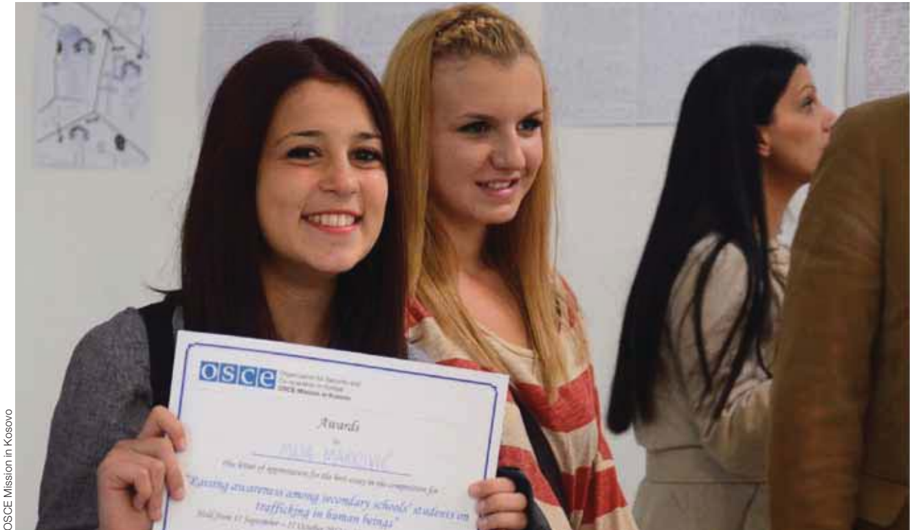
OSCE Mission in Kosovo