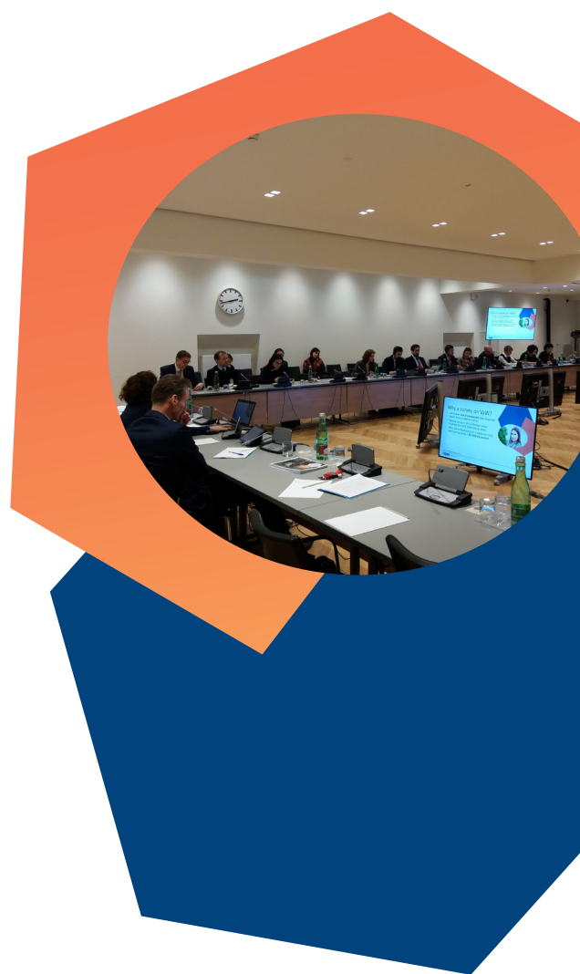
Members of OSCE delegations listening to the presentation of the project, January 2018

The co-operation with OSCE Field Operations, who cover the locations where the survey will be implemented, will be crucial for the proper and long-term engagement of local level stakeholders and the dissemination of the research findings.