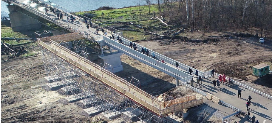
Repaired section of Stanytsia Luhanska bridge (Image from an SMM mini-UAV)