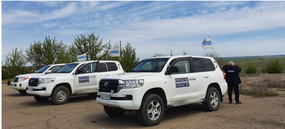
An SMM patrol near Orlyvske in Donetsk region