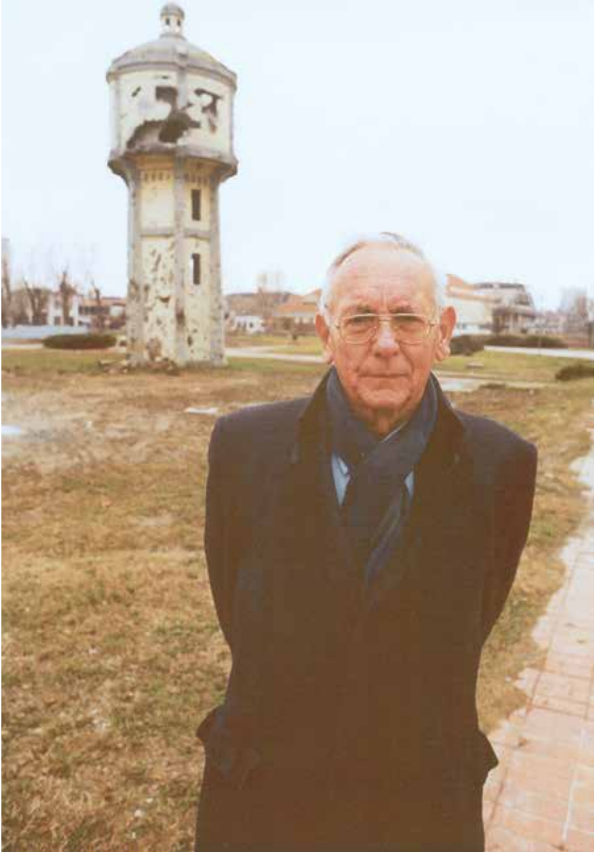
Max van der Stoep, first OSCE High Commissioner on National Minorities, 1992–2001