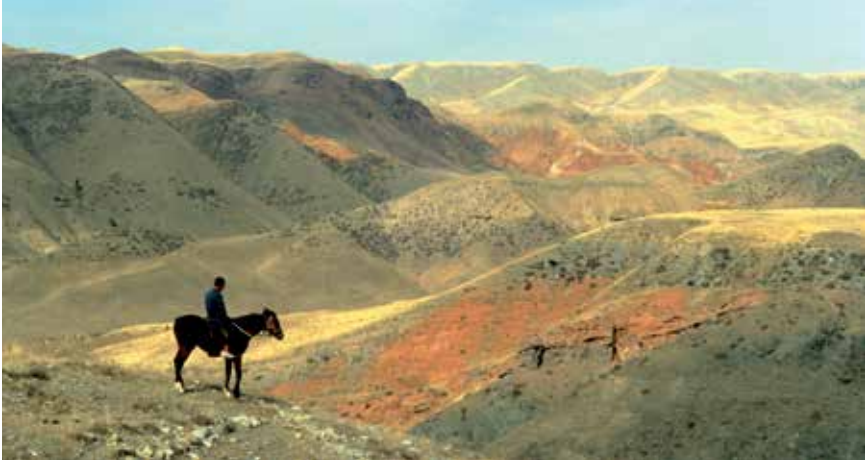
SOUTHERN KYRGYZSTAN, OSH REGION.

A Central Asian country of incredible natural beauty and proud nomadic traditions, most of Kyrgyzstan was formally annexed to Russia in 1876. Kyrgyzstan became a Soviet republic in 1936 and achieved independence in 1991 when the USSR dissolved.