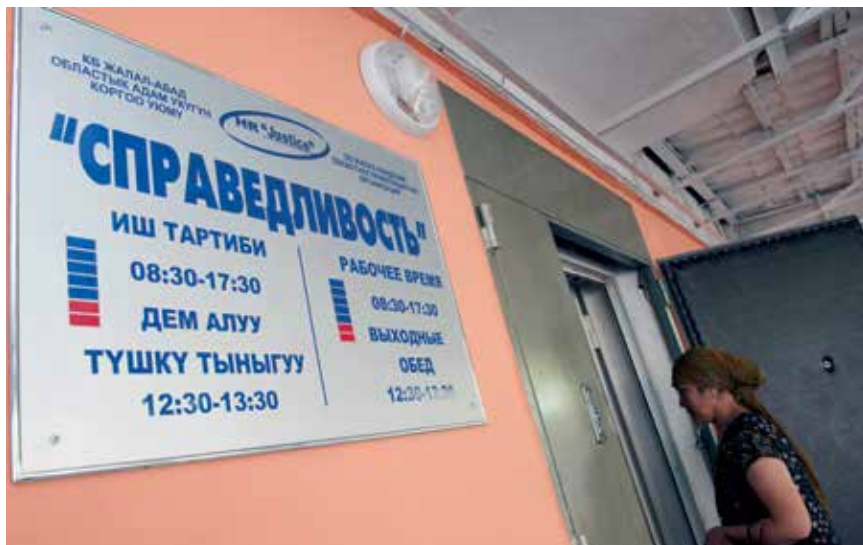
A CLIENT** VISITS SPRAVEDLIVOST’S OFFICE IN JALAL-ABAD CITY