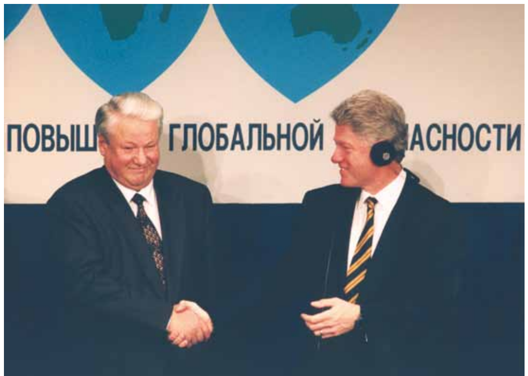
Russian Federation President Boris Yeltsin (left) and United States President Bill Clinton (right) at the 1994 OSCE Summit in Budapest.

Bill Clinton (United States), Kohl, John Major (United Kingdom) and François Mitterrand (France) were preoccupied by relations with Russia and divisions in NATO on how to stop the conflict in Bosnia and Herzegovina. The NATO summit in January 1994 had confirmed that the Alliance was open to new members. Enlargement would “reach to democratic states to the east of NATO”, albeit not including Russia. The Russians could see that their vision of transforming the CSCE into a fully fledged international organization at the apex of a hierarchy of regional security organizations, with legal personality and its own security council consisting of the United States, Russia and the European Union (EU), would not become reality. At Budapest, Boris Yeltsin spoke of a “cold peace”. But the Russian economy was weak, and Yeltsin’s commitment to working together with Western partners strong. In 1994, the last Russian forces withdrew from Germany and the Baltic states. Yeltsin agreed to withdraw the 14th army from Moldova. The British and Russian foreign ministers wrote a joint article on European security, published in the Financial Times and Izvestia .