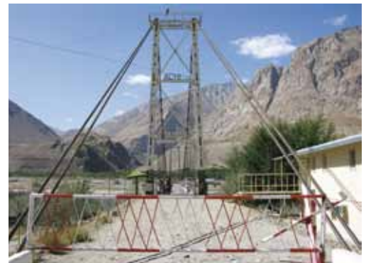
Looking to Afghanistan from Khorog, Tajikistan. Photo taken during the assessment phase of the Office in Tajikistan's customs assistance project.

Some months earlier, in October 2009, a first contingent of a dozen Afghan border police detachment commanders crossed into Tajikistan to take part in a workshop designed to revive the mechanisms of the border delegates. These are mechanisms that were put in place between the Soviet Union and Afghanistan in 1958 and have been on hold since 1991. The cross-border cooperation workshop, which runs under the unified budget of the Office in Tajikistan, was repeated in 2010 and will be held again in 2011, advancing further each time towards reviving the cooperation mechanisms.