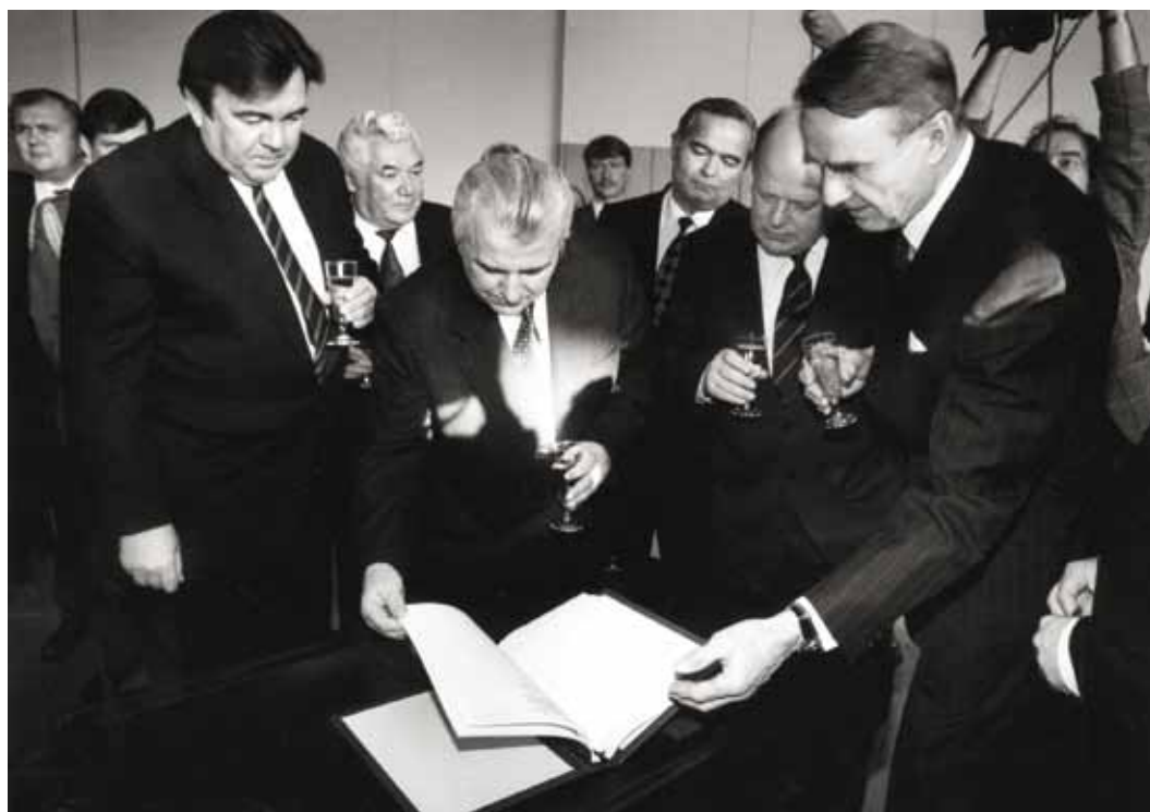
Ukrainian President Leonid Kravchuk leaves through the final document of the 1992 OSCE Summit in Helsinki, The Challenges of Change .

As mentioned in another paragraph, “The aspirations of peoples freely to determine their internal and external political status have led to the spread of democracy and have recently found expression in the emergence of a number of sovereign States. Their full participation brings a new dimension to the CSCE.” This geo-political dimension became obvious when the seating arrangement around the negotiating table expanded by 28 seats (14 times two) in the spring of 1992. The first to join the initial 35 CSCE States was Albania. This occurred during the Ministerial Council in Berlin in June 1991. The accession of Latvia, Estonia and Lithuania took place during the first additional Ministerial Council, convened in Moscow right before the third Human Dimension Conference in September 1991. During the second Ministerial Council held at the end of January 1992 in Prague, ten more countries became fully fledged participating States: Armenia, Azerbaijan, Belarus, Kazakhstan, Kyrgyzstan, Moldova, Tajikistan, Turkmenistan, Ukraine and Uzbekistan.