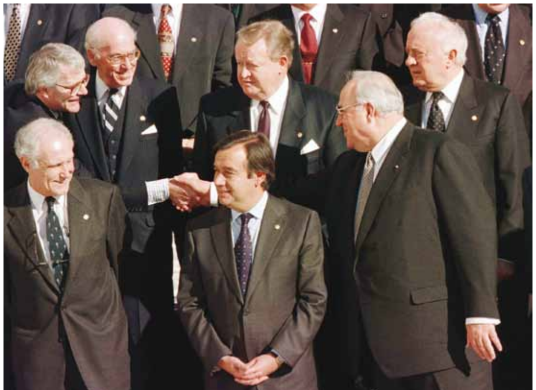
British Prime Minister John Major reaches over Portuguese Prime Minister Antonio Guterres to greet Germany's Chancellor Helmut Kohl, as Georgian President Eduard Shevardnadze (right), Finnish President Ahtisaari Martti (centre) Estonian President Lennart Meri (second from left) and Switzerland's Foreign Minister Flavio Cotti (left) look on. OSCE Lisbon Summit, 2 December 1996

Let’s remember the political context. A few days after Lisbon, the NATO Council was to make its definitive decision to hold a Summit in Madrid in July 1997, at which the first round of NATO enlargement to include Central and Eastern European countries would be settled. Throughout 1996, work was going on to achieve an agreement between the Russian Federation and NATO. Until Lisbon, Russia insisted on the condition that an agreement would have to precede the decision on NATO enlargement. NATO, on the other hand, wanted to develop the security partnership in parallel to the opening up of the Alliance. This disagreement was without doubt the most important single issue preceding the Lisbon Summit.