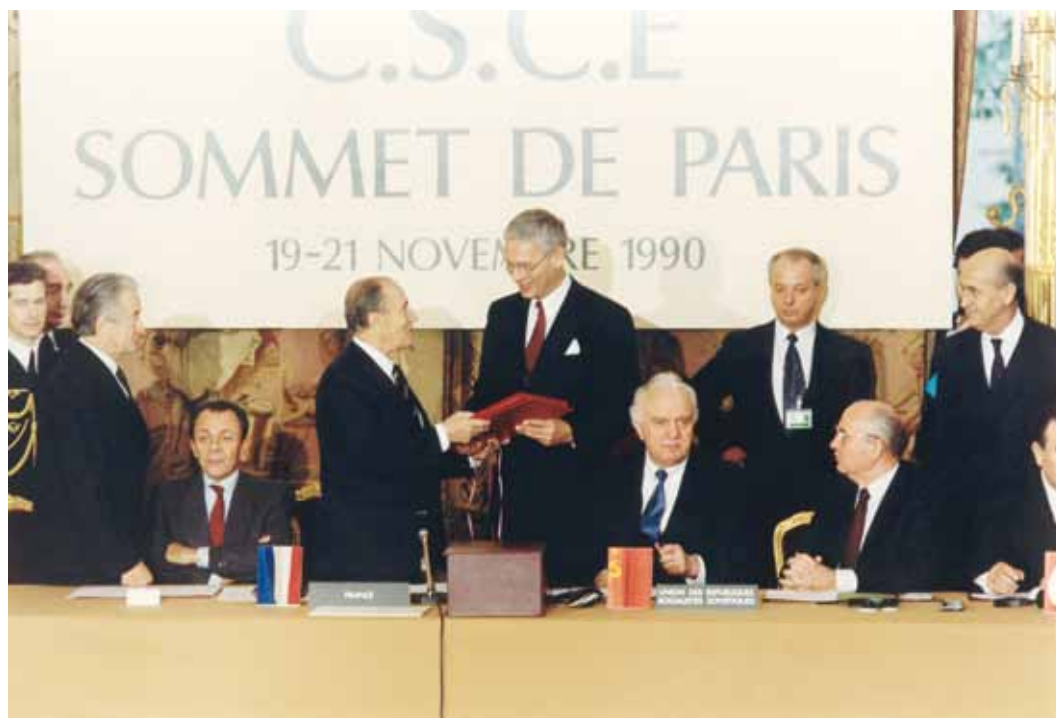
French President François Mitterrand (centre left) and Netherlands' Foreign Minister Hans van den Broek (centre right) hold the Charter of Paris for a New Europe at the 1990 OSCE Summit in Paris.

All of the giants of the age came to Paris for the Summit between 19 and 21 November: George H.W. Bush, Mikhail Gorbachev, Helmut Kohl, Margaret Thatcher and Vaclav Havel, to name a few. Mitterrand, as host, graciously said that the Paris Summit was unlike other peace conferences of the past since there were neither victors nor vanquished. He also pointed out that, whereas in the past, peace conferences had involved adjusting the balance of power, the CSCE would be based on the solidarity of values. Indeed, the Paris Charter is a keystone in defining the OSCE as a community of values, every bit as much as a community of security.