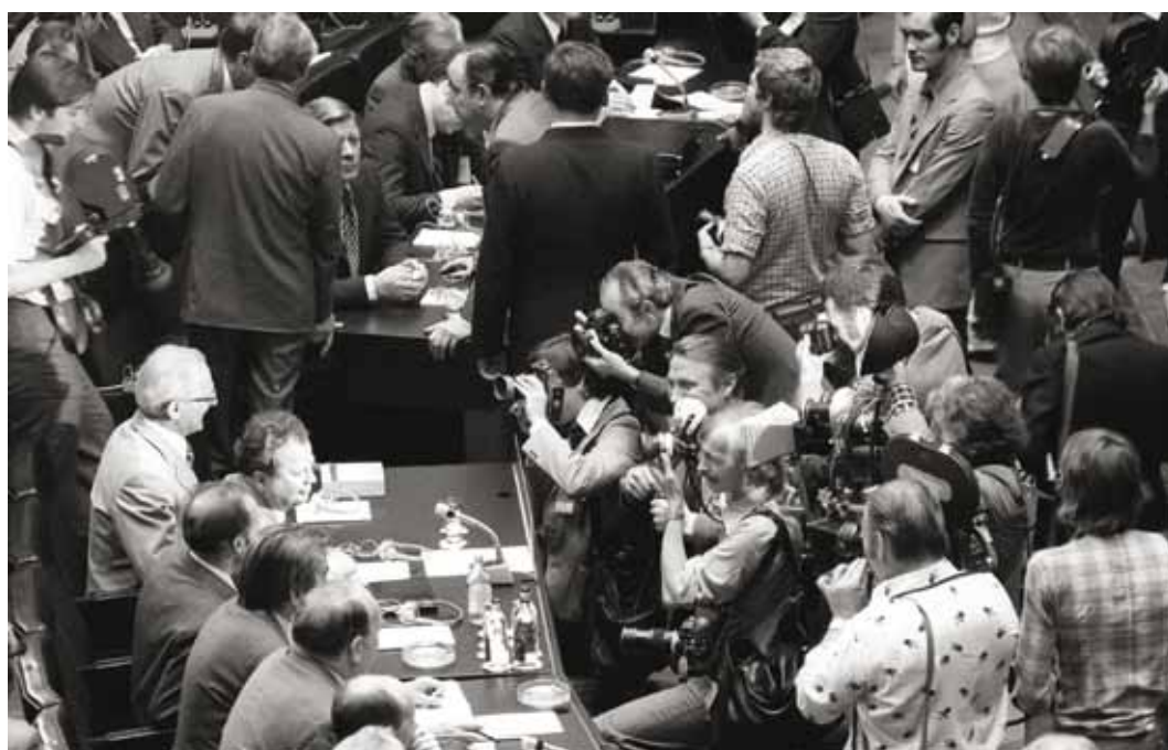
Journalists crowd in for a shot at the opening of the Conference on Security and Co-operation in Europe in Helsinki on 3 July 1973.

Nevertheless, in the marathon of negotiations from 1972, when multilateral consultations on the agenda and the modalities of the Conference began, through 1975, when the Helsinki Final Act was signed, the Soviet leadership was confronted with the choice of whether or not it was prepared to pay a price for the success of its endeavour. It finally decided to do so. It accepted the idea of extending the agenda of the CSCE to include the human dimension chapter, which sought to facilitate human contacts and the information flow between East and West, and a set of confidence-building measures. It also agreed to the inclusion of the respect for human rights and individual