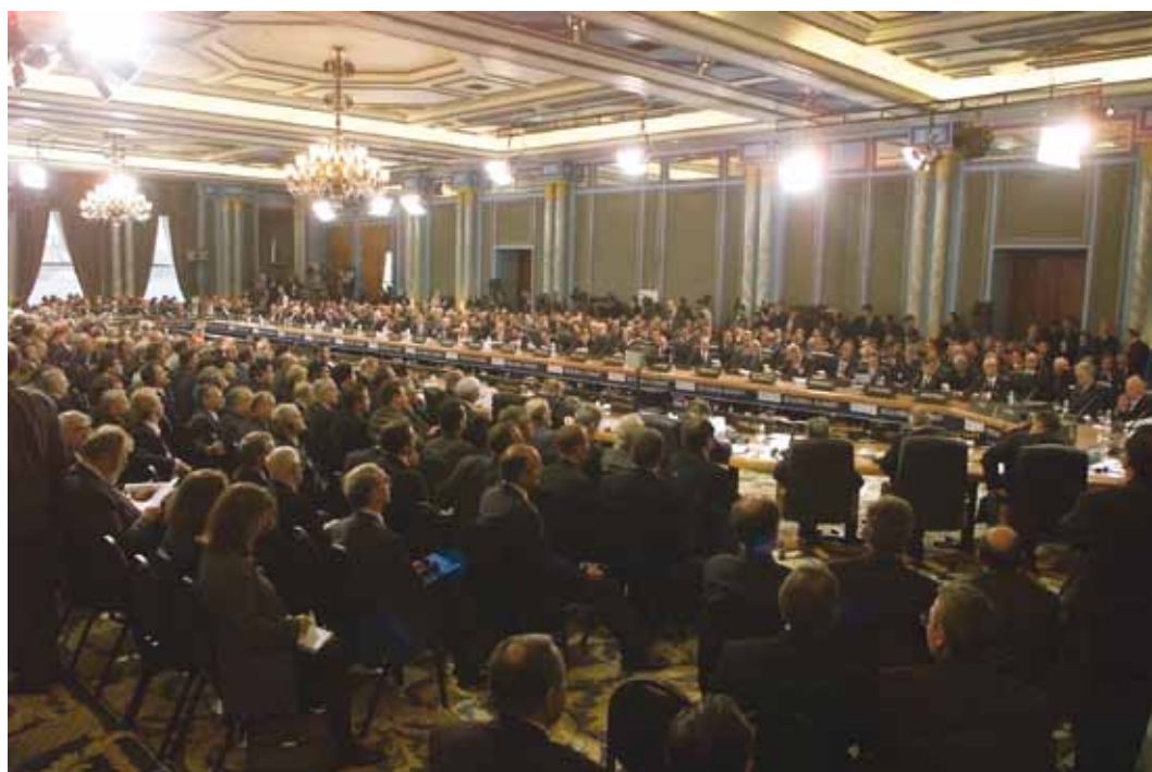
Overall view of the Heads of State and officials gathered at the Ciragan Palace in Istanbul for the opening session of the OSCE Summit, 18 November 1999

From the perspective of 1999, however, the Euro-Atlantic and Eurasian security landscape did not look so harmonious. Consider the events that dominated the months leading up to the Summit: