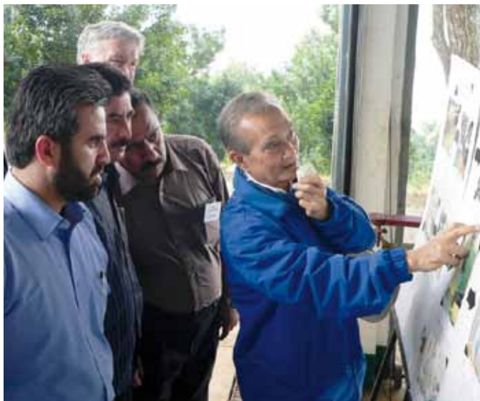
A Thai expert illustrates project activities to officials from Afghanistan and OSCE Ambassadors

In 2010, ten Afghan officials, including the Deputy Minister of the Interior in Charge of Counter-Narcotics, took part in the Workshop on Combating Illicit Crop Cultivation and Enhancing Border Security and Management: Thailand as a Case Study , held from 24 to 28 January 2010 in the Chiangmai and Chiangrai provinces of Thailand. They were sponsored with contributions from Finland under the Partnership Fund, established in 2007 to sponsor Partners for Co-operation to participate in OSCE activities.