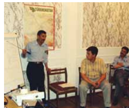
Two Afghanistan customs officers (in uniform) speaking to their Turkmenistan counterparts, Atamyrat, Turkmenistan

These projects were the first of the OSCE border projects actually implemented in support of the 2007 MC decision on engagement with Afghanistan, and proved useful to all stakeholders, as the co-operation and co-ordination they established has continued through all other engagement activities.