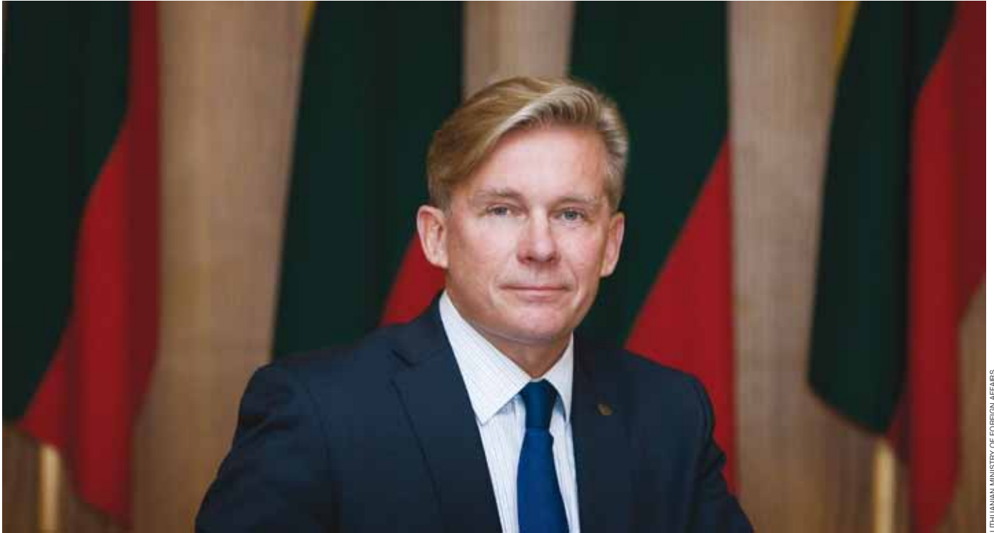
LITHUANIAN MINISTRY OF FOREIGN AFFAIRS