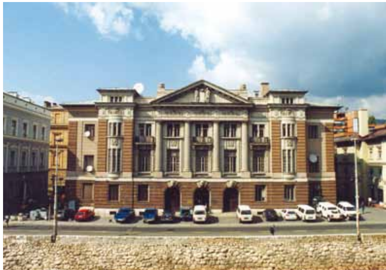
The Mission to Bosnia and Herzegovina's first headquarters in downtown Sarajevo (OSCE)